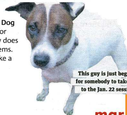
This guy is just begging for somebody to take him to the Jan. 22 session.

Jan. 29, noon-2 p.m., Dog Massage Therapy: “For older dogs, this really does help with joint problems. Who doesn’t like a massage?”